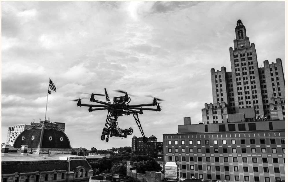
U.F.O. witnessed at recent LRI rooftop event.

"We encourage everyone, alumni and non-alumni alike, to attend our Super Party," said Ritz. "We'll congratulate our