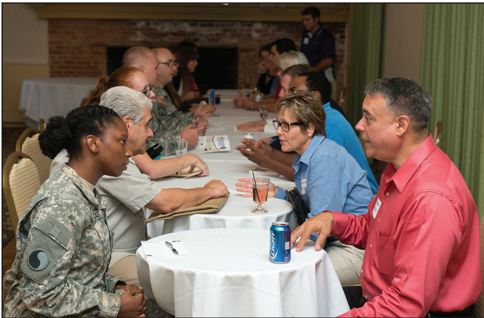
Military veterans had the chance to "speed" chat with prospective employers at the Ground Show, held at the Quonset 'O' Club and organized by a team of Iota IIs.

Members of the seven other Iota II project teams attended the ground